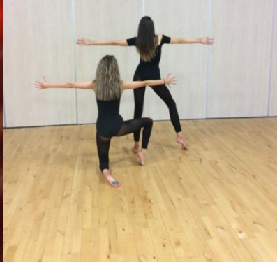
Can you guess our pupil couple...