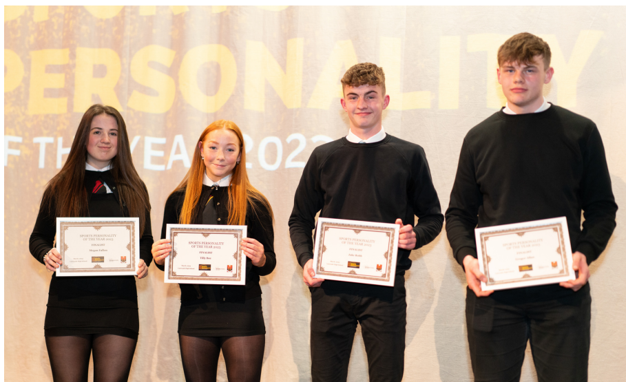
The Four SPOTY Finalists