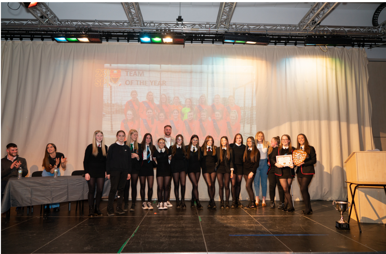
Team of the Year: Senior Girls Football Team