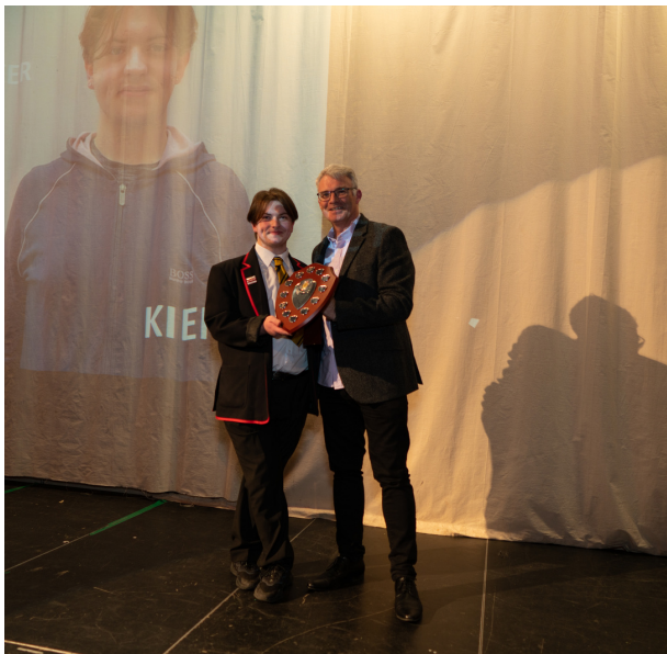
Pupil Volunteer of the Year