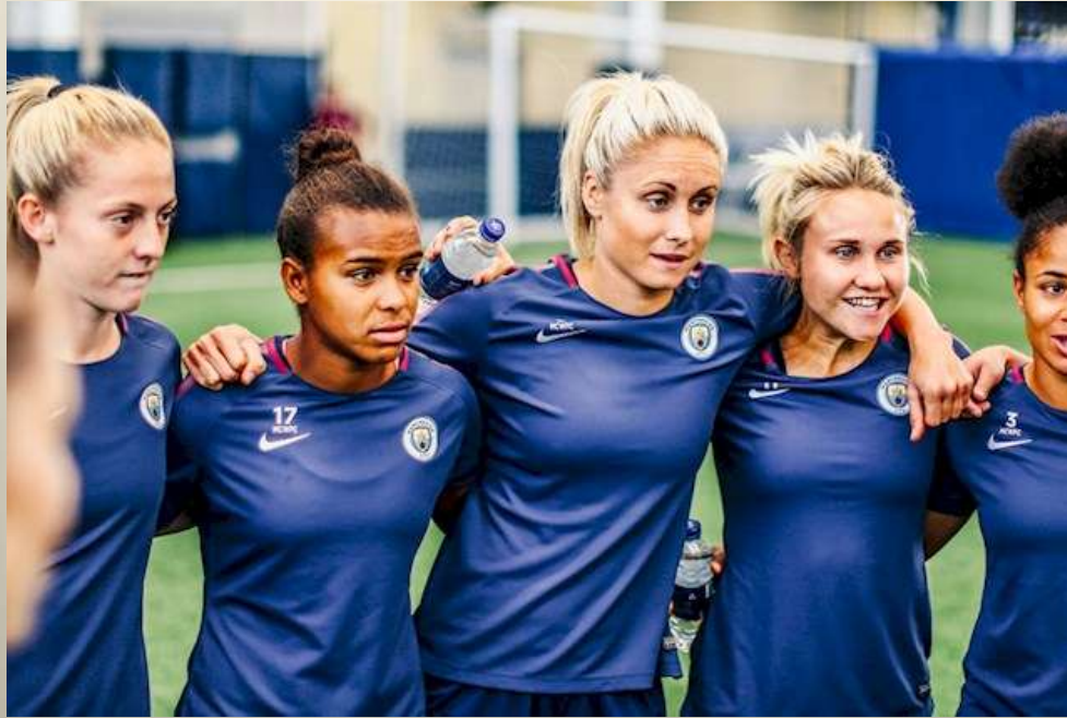
Junior & Senior Girls

Could you please return any School Football Strips you have by Wednesday to the PE department